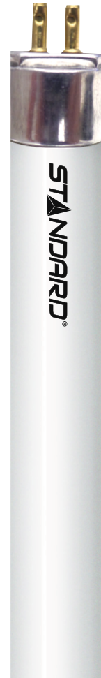
Nominal length : 22 in (559 mm) Dia. : 5/8 in. (16 mm)

1 The life rating indicated is based on 3 hour burning cycles under specified conditions and with ballast meeting ANSI specifications. 2 The minimum starting temperature is a function of the ballast.