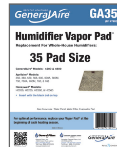
For Model GF-4200