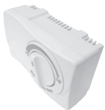
GF-MHX3 Manual Humidistat