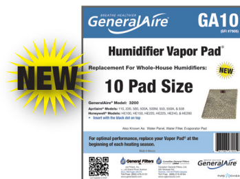
For Model GF-3200