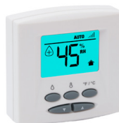
GF-X3 Automatic Humidistat