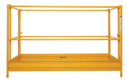
600S-02 Guardrail Kit with built in Toe Boards.