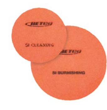
Sealant Infused (SI) Cleaning and Burnishing Pads