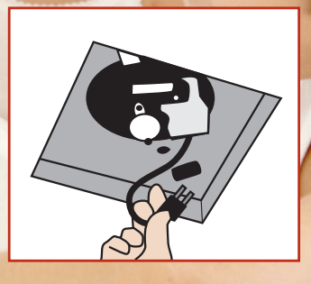
3 Install new motor assembly into existing fan housing.