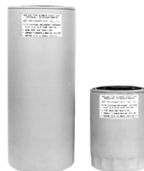
A-4000-633 (20 scfm) A-4000-632 (10 scfm)