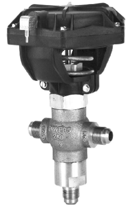
658 Powertop Sequence Valve.