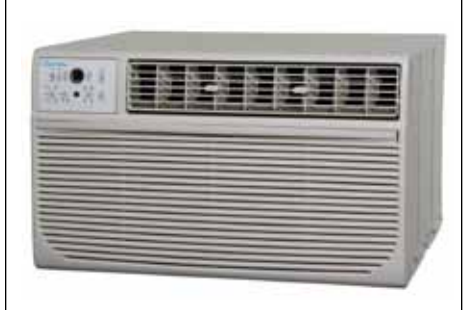
BG-143J 14,000 BTUH Nominal