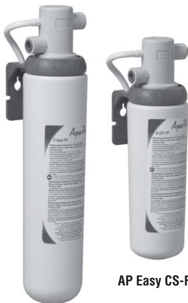
AP Easy CS-FF