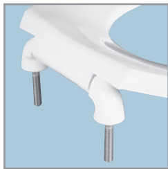
PLASTIC HINGES WITH STAINLESS STEEL POSTS AND PINTLES