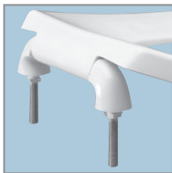
PLASTIC HINGES WITH STAINLESS STEEL POSTS AND PINTLES

Non-Corrosive 300 Series Stainless Steel Posts and Pintles