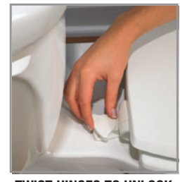
TWIST HINGES TO UNLOCK