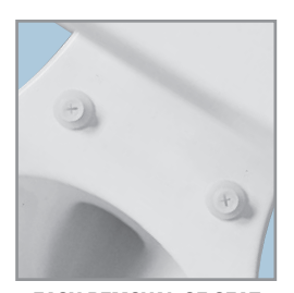
EASY REMOVAL OF SEAT FOR THOROUGH CLEANING