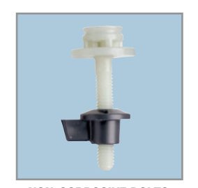
NON-CORROSIVE BOLTS AND WING NUTS