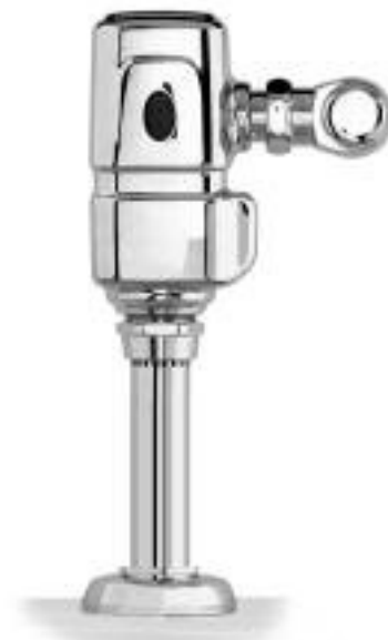
P403-BP Model Shown

Dimensions are shown in inches [mm] and are for reference only.