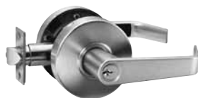
ENTRY ENTRANCE/OFFICE INSIDE TURN BUTTON