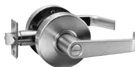
PRIVACY RESTROOM INSIDE TURN BUTTON