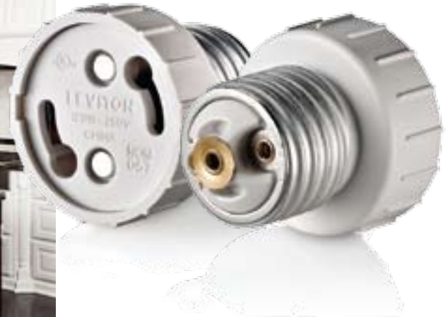
Screw shell adaptor is available in a single configuration: Cat. No. 26745