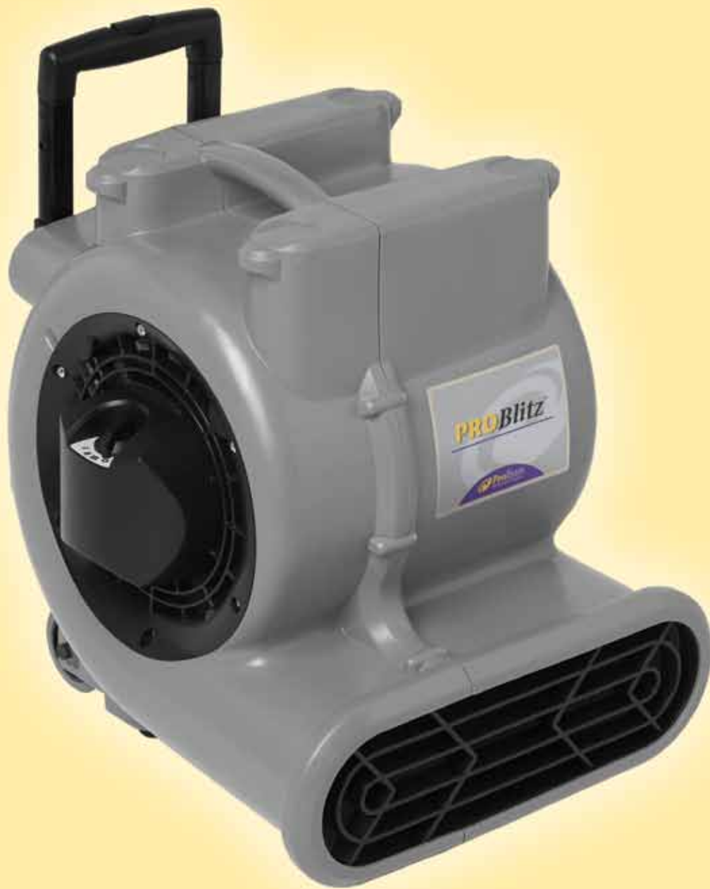
ProBlitz XP AirMover shown