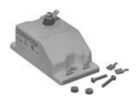
5059-23 Pilot Relite Control