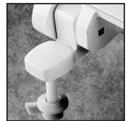
"LOCKED-IN" TOP-TITE® HINGE