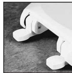
TOP-TITE® HINGES FEATURE NO-SLIP WASHER

Ring thickness is 5/8" Ring thickness including the bumper is 15/16" Height of the seat with cover is 2-9/32"