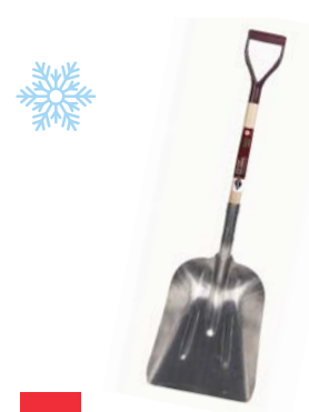
$79.99 GAG08D 13" Garant Snow/Grain Scoop Shovel. Aluminum Blade. 45-1/2" long.