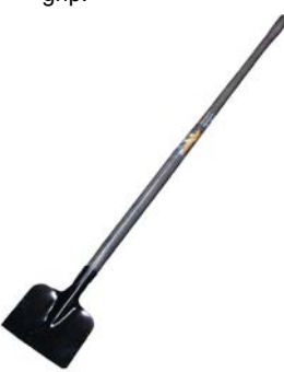
G-TBHSW7 7" Steel Scraper. Blade size: 5-1/2" x 7" stamped and tempered steel. Premium stained ash profiled 48" handle.