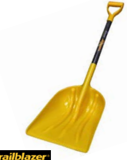
$36.99 G-TBPG12D 14-1/2" Poly Grain Scoop with Handle. Blade size 14-1/2" x 18-1/2", 30-1/4" stained and seal-coated hardwood handle with 4" poly "D" grip.