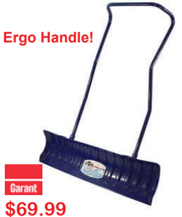
YPP36KU 36" Yukon 36" Extra Wide Snow Pusher. Lightweight strong tubular steel.